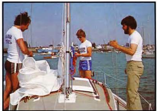
Good access forward.