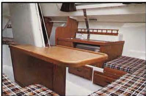
Optional interior layout.