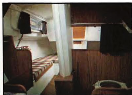
Separate sea or chemical toilet.