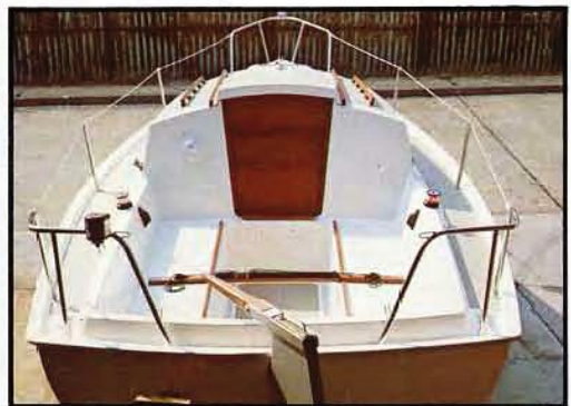
Design and construction integrity to provide safe and very sound sailing craft.