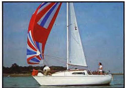
Simple and efficient rig.