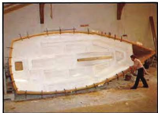
Advanced G.R.P. engineering techniques.

From all this, the resulting boat has a good turn of speed, behaves well in all conditions, and is an all round family cruiser. We think we have achieved our initial aims in producing a pleasure boat which is a pleasure to sail and use, designed and built by practical people for practical use.